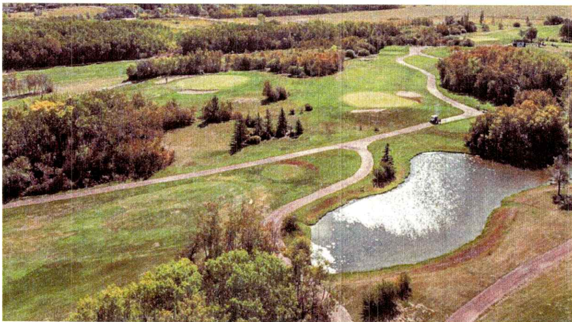
Overview of holes 8 & 9